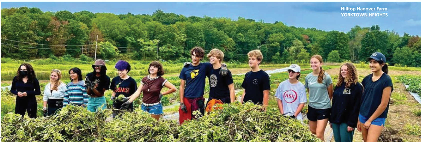
Hilltop Hanover Farm YORKTOWN HEIGHTS

When there are no limitations on who is included, there are no limits to what we can accomplish.