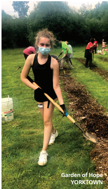
Garden of Hope YORKTOWN