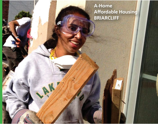
A-Home Affordable Housing BRIARCLIFF

At WYA not only is everyone invited, each participant is involved. Robust programming includes community service as a vehicle to bring teens together. We provide meaningful opportunities to learn with and from each other and provide opportunities for teens to engage in dialogue and action based on common values. Activities include service projects, art projects, and regular gatherings to connect, reflect, and plan.