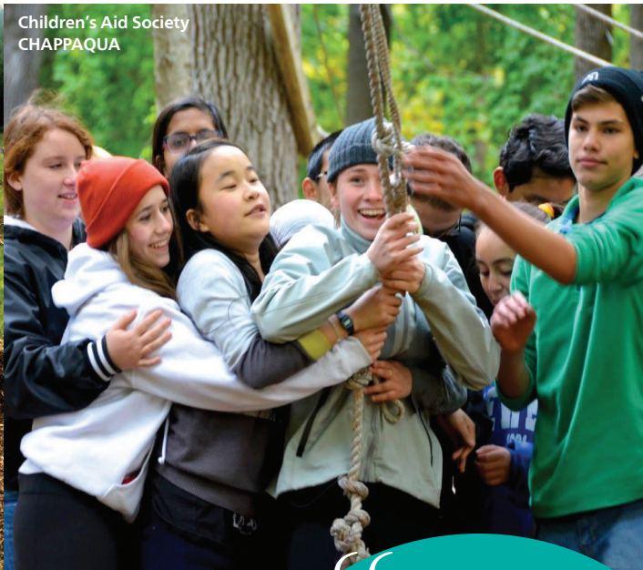
Children's Aid Society CHAPPAQUA