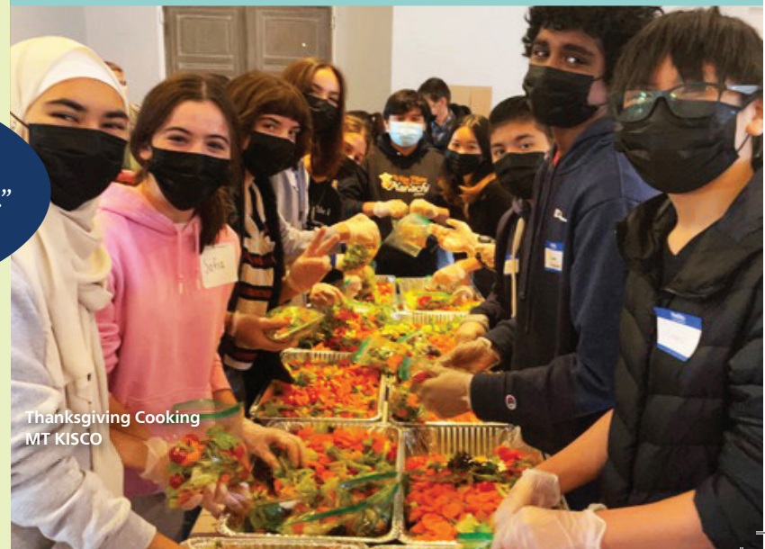
Thanksgiving Cooking MT KISCO